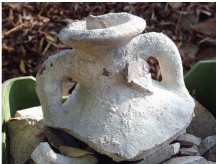
The Romans covered the discarded amphorae in lime to mask the smell of the decaying olive oil.

emperor in 27 B.C., knew that his power base came from two sources—the army and the plebs , or common people. He also understood that the needs of a growing population of Rome (between 600,000 and one million in the first century A.D.), along with a massive army stationed along frontiers from Spain to Syria, demanded a sophisticated and complex system to transport food and raw materials between Rome and its provinces. The emperor ensured the army's support by paying and feeding it. He likewise bought the plebians' loyalty by continuing the tradition, established in the mid-first century B.C., of providing them with access to free grain and by subsidizing the price of olive oil much like the current state-regulated price of tortillas in Mexico or baguettes in Tunisia. More than a century after Augustus, the Roman satirist Juvenal would give lasting expression to this populist approach in the famous line about the emperor giving the Romans "bread and circuses" in exchange for their freedom. To administer these needs, Augustus set up the praefectura annonae , or "prefect of the provisions," an office whose function remains hotly debated. Some scholars believe the annona only handled the grain distribution for the plebs . But Remesal argues that the office served all of Rome's inhabitants and dealt with many products, including olive oil. "From Augustus's time, olive oil amphorae from Baetica are found at Monte Testaccio and as far as the northern