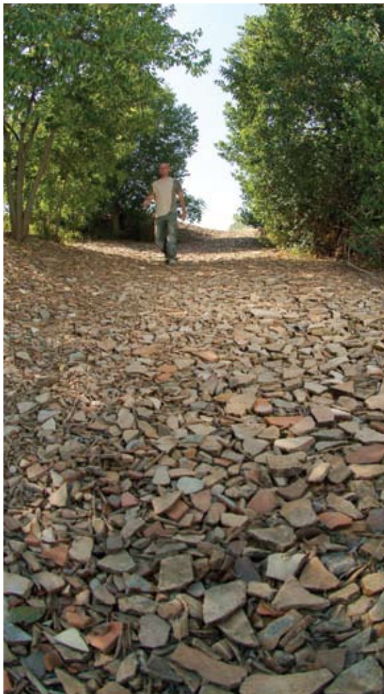
An excavation worker walks down a sherd-strewn path from the top of Monte Testaccio.

chained prisoners and captured kings and queens dragging behind them. Looking east to the Colosseum, I hear the roar of the crowd as two gladiators fight to the death. But in a way that no temples, triumphal arches, or arenas ever can be, Monte Testaccio is incontrovertible evidence of the Romans' ability to move the empire's vast resources in an organized fashion, to feed their people, and to offer them a previously unknown level of stability. On the last day I am at Monte Testaccio, a University of Barcelona student going through a bucket finds an amphora missing only its base—the shoulders, neck, and handles are complete and the stamp and tituli picti are still there. Remesal takes the amphora and hands it to me, a smile creeping over his face, and says, "Here history is not read in books. We read history on the pots." ■