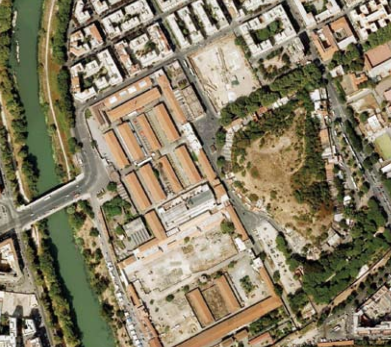
Monte Testaccio stands near the Tiber River in what was ancient Rome's commercial district. Many types of imported foodstuffs, including oil, were brought into the city and then stored for later distribution in the large warehouses that lined the river.

place where you can study economic history, food production and distribution, and how the state controlled the transport of a product," Remesal says. "It's really remarkable."